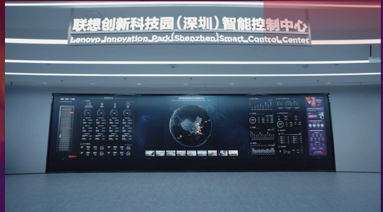
Lenovo Innovation Park – Smart Control Center (Shenzhen, China)