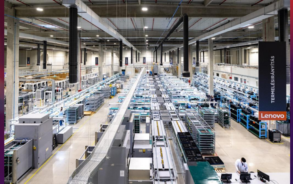
Lenovo's First European In-House Manufacturing Facility in Ullo, Hungary

Lenovo has slashed the time taken to create production schedules from two hours to just two minutes. Over 75% of the process is now automated, and the new solution has an adoption rate of almost 95%—a testament to how well it meets the needs of the company’s planners.