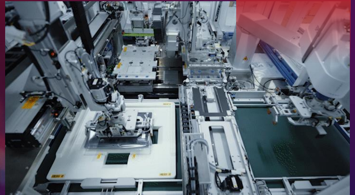
Lenovo South Smart Campus (LSSC) Shenzhen, China

Senior IT Manager, Digital Insight Lenovo