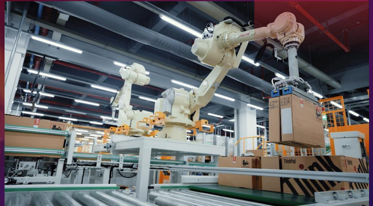
Lenovo South Smart Campus (LSSC) Shenzhen, China

The challenges that we faced in our global business are by no means unique. The Lenovo APS solution could deliver similar transformative benefits for manufacturing and logistics companies of practically any type.