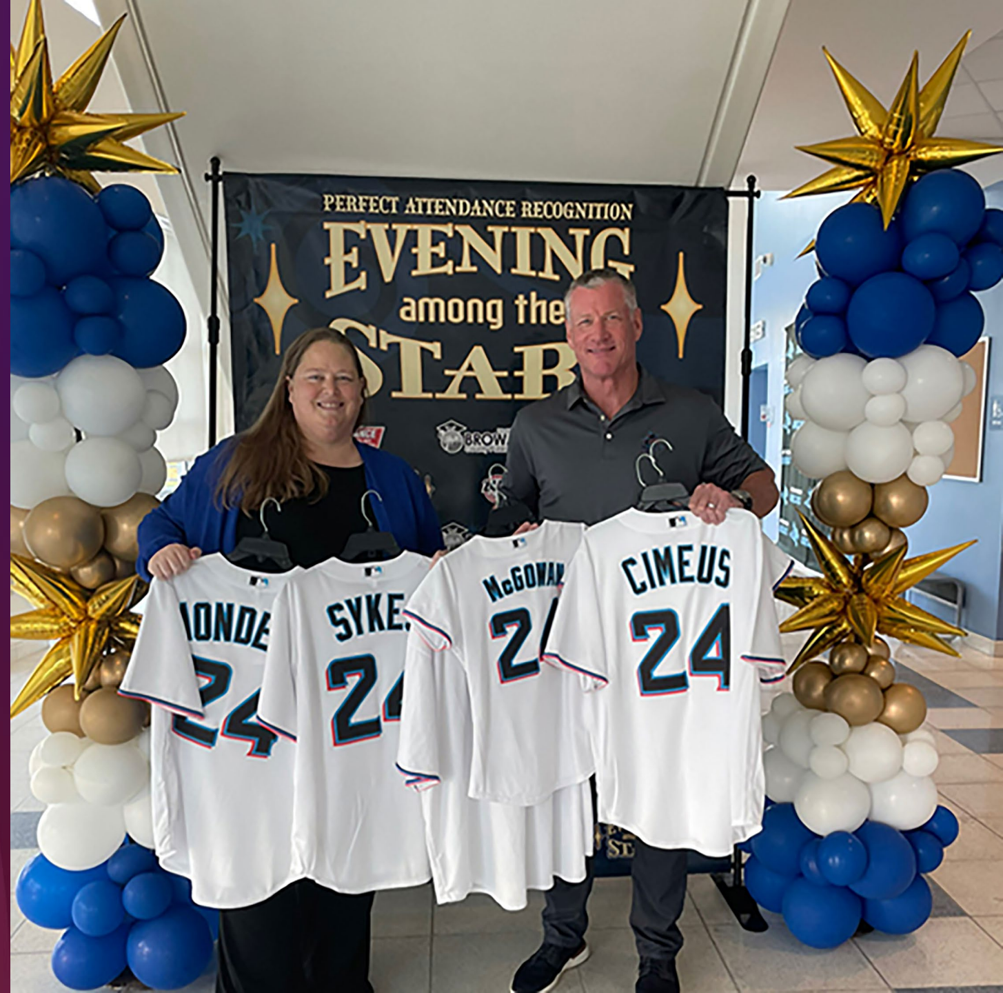
Image: Marlins World Series Champion Jeff Conine presents jerseys.